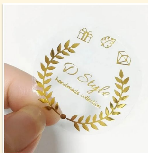
Gold Foil Labels