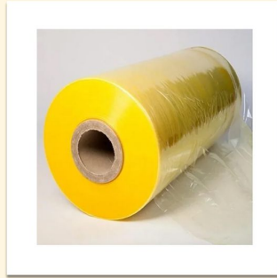
Poly & VCI