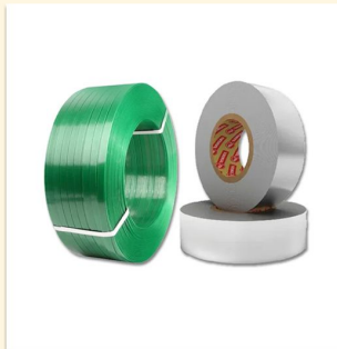
PP Strap & Pet Strap