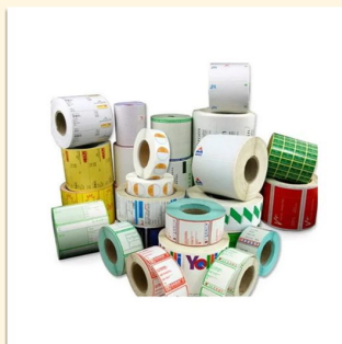
Printed & Plain Labels