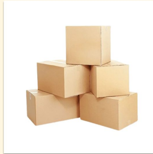
Plain & Printed Carton Box