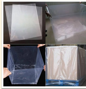
3D LD Bag