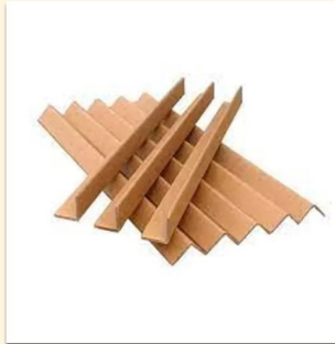
Angle Edge Board